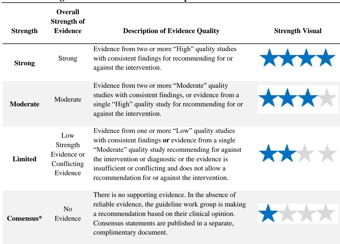
Table 1. Strength of Recommendation Descriptions